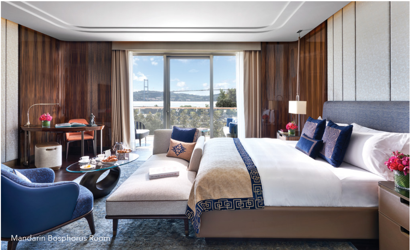
Mandarin Bosphorus Room

Mandarin Oriental Bosphorus, Istanbul offers a curated selection of rooms and suites that combine refined design, spacious layouts and exceptional views of the Bosphorus or hotel gardens.