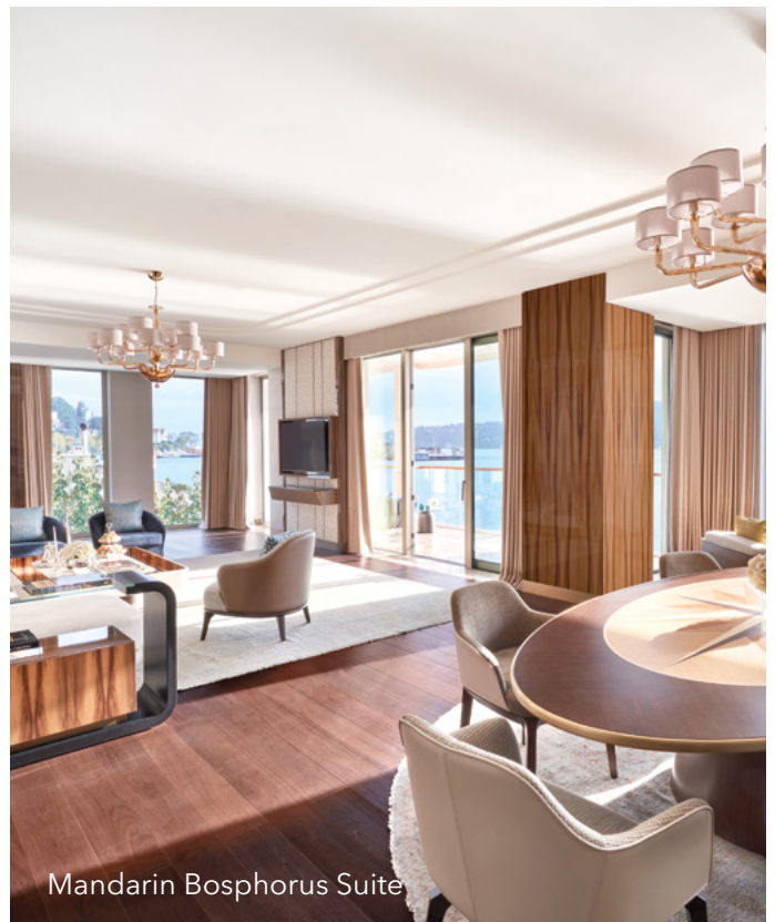
Mandarin Bosphorus Suite

Royal Bosphorus Suite - The most luxurious suite with expansive living spaces, private gym and bespoke amenities.