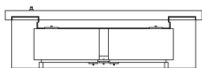
Typical Mounting of QO/QOB Circuit Breakers